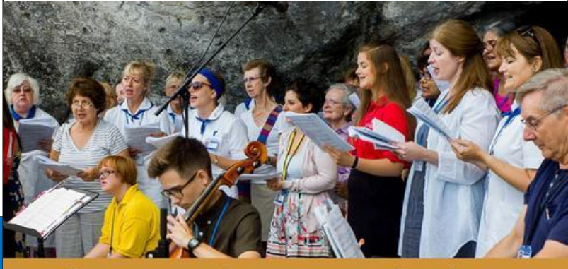
PILGRIMAGE ANNIVERSARY BIG SING

Please use the following link for further details and to let us know you are coming along: Lourdes Pilgrimage Anniversary Big Sing