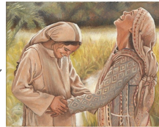
image. That joy is also expressed in the Magnificat, which follows the story from Luke that we hear in today's Gospel. Mary sings, "the Almighty has done great things for me". Yet, at this point there was a great deal of uncertainty. We know that things did not exactly go smoothly for the Holy Family! Being able to rejoice in God's gifts, even when we face challenges and difficulties is something we can learn from Mary as we prepare to celebrate Christmas.

But this year we don't hear about the announcement of Jesus birth (the 'Annunciation'), rather we hear about the story that comes immediately after: the Visitation. It is a story filled with joy, a joy which I think is beautifully captured in this